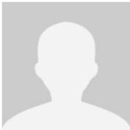
Lalaine Siruno (Full-Time)